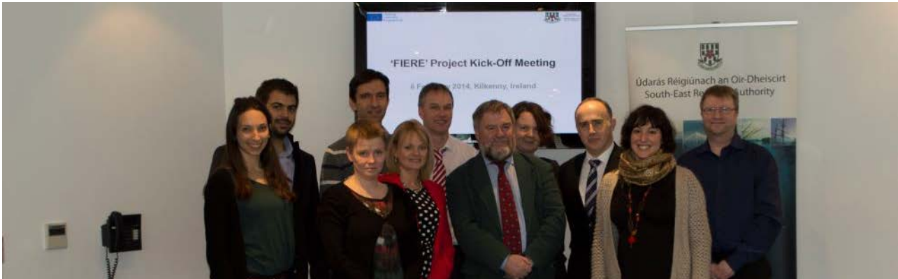
The FIERE project partnership at the kick-off meeting in Kilkenny, Ireland on 6th February 2014